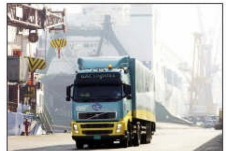
GAC is in the process of improving its lay-up solution.

"From the comprehensive range of solutions, clients can pick and choose the scope and extent of services for fully tailored packages that meet the needs unique to their vessel type and area of trade."